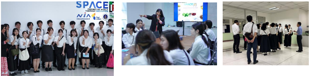
7 th Sep. 2023 Visit to the Embassy of Japan in Bangkok