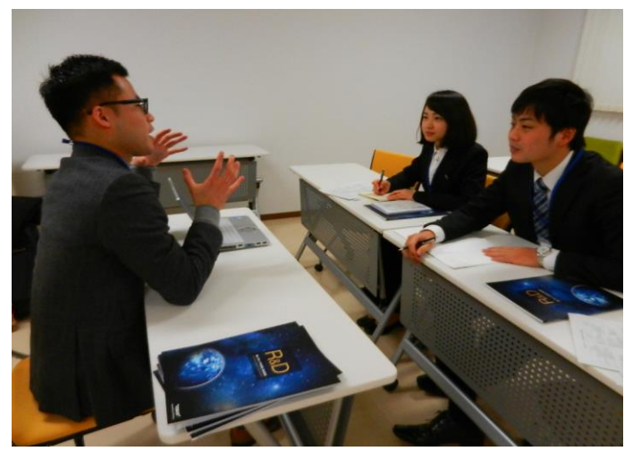
4) Kaneka Corporation